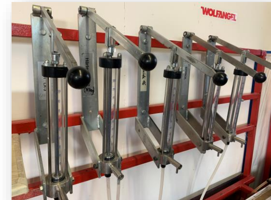
Wall Dispenser stainless steel without limit stop